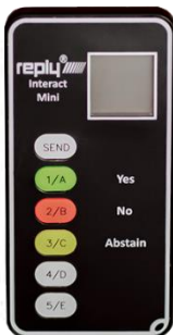
Interact Mini Keypad & USB Stick Base Station